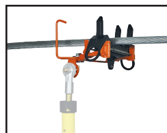
Push to snap closed (tool sold separately)