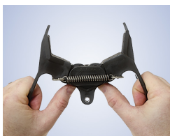
Opening the SnapFast clamp