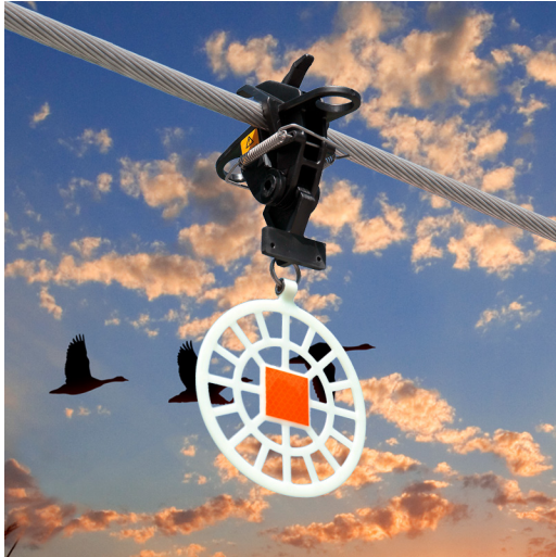
BirdMark bird diverter

Recommended by the U.S. Fish and Wildlife Service, budget-friendly BirdMark bird diverters are comparable to our highly effective FireFly® bird diverters in preventing bird strikes on power lines.